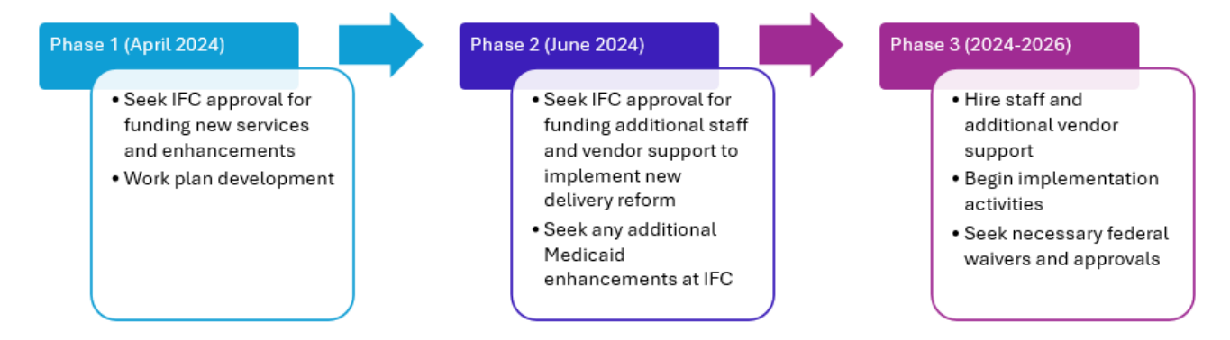
Figure 2: Initial Phases for Implementation

There are several key phases to implementing these new reforms so that Nevada children have access to a robust continuum of care for behavioral health services. The first phase consists of obtaining authority to spend up to 15 percent of revenue from the state's private hospital tax to finance new services and enhancements for children's behavioral health care. The next phase consists of seeking additional funding authority to support the establishment of certain reforms to the state's Medicaid delivery system for this child population. Such reforms are necessary to build an adequate provider network and provide an integrated benefit set to eligible children. The third phase consists of the activities necessary for implementation of these new services and enhancements and changes to the delivery system.